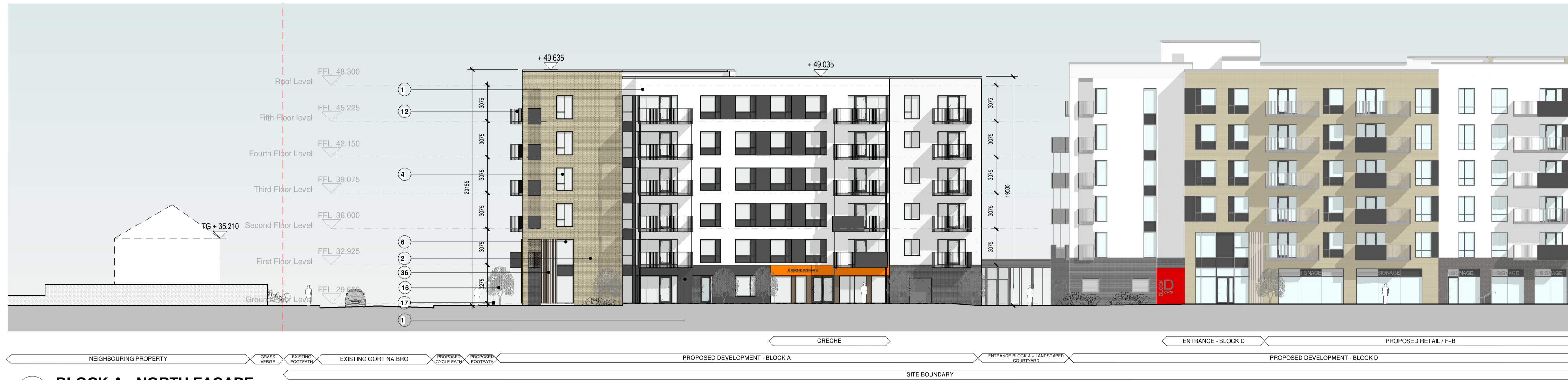
3 BLOCK A - NORTH FACADE 1 : 200