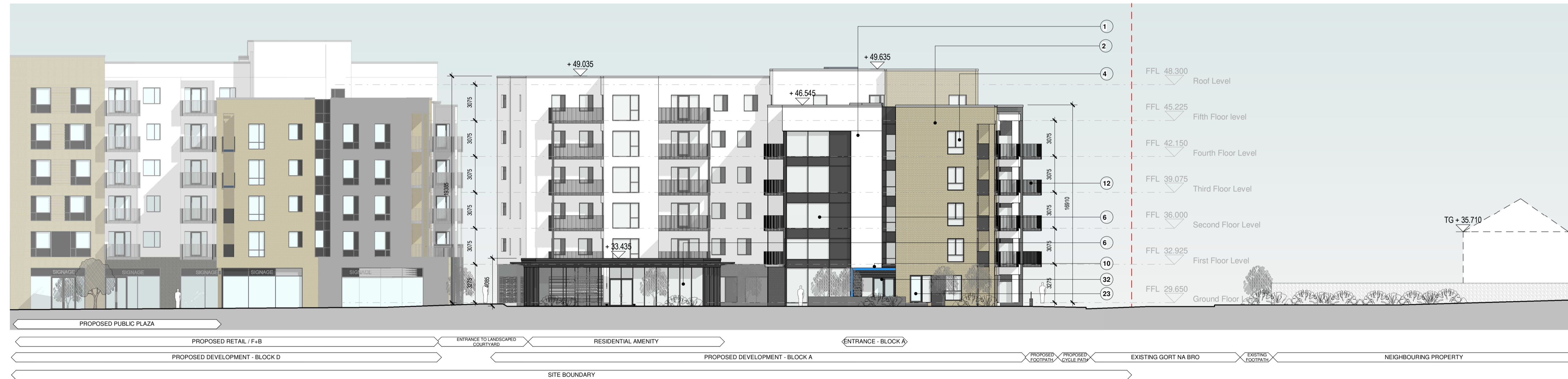
4 BLOCK A - SOUTH FACADE 1 : 200